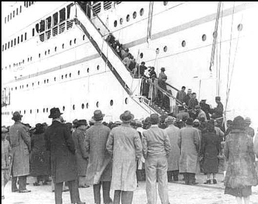
After the Anschluss (German annexation of Austria), Austrian Jewish refugees disembark from the Italian steamship "Conte Verde." Shanghai, December 14, 1938.